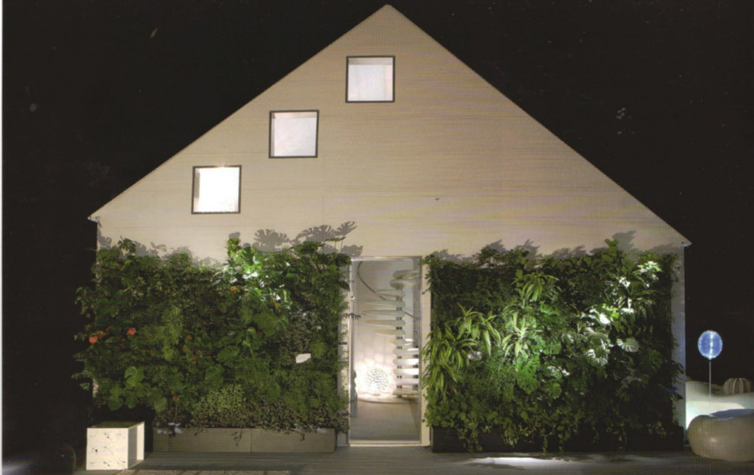
La parete verde di Green Home. The green wall of Green Home.

caldo ed accogliente di chi vuole sognare. E come dice il proverbio: ad ogni uccello, il suo nido è bello.”