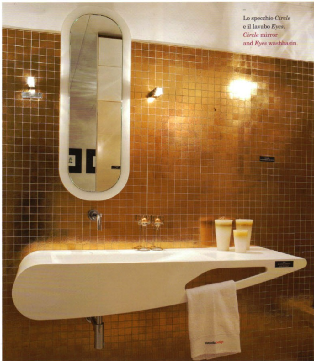
Lo specchio Circle e il lavabo Eyes . Circle mirror and Eyes washbasin .

elegant and minimalist shower floor, which creates an impalpable feeling of lightness. To this is added a multi-layer Wengè-tinged Okumè wood platform that looks like a leaf with natural veins, a dominant theme of the overall structure, and which carries over to the serigraphic details that enhance the methacrylic-acid sheet.